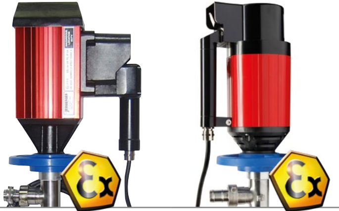
Electric drum pump JP-400 motor with pump tube (41 mm)