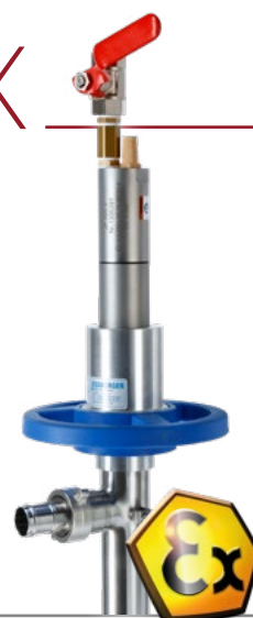
Air operated drum pump JP-Air 1 motor with pump tube (41 mm)