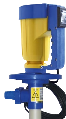
Electric laboratory pump JP-120/JP-140 motor with laboratory pump tube (25–32 mm)