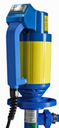
Electric drum pump JP-160/JP-180/JP-280 motor with pump tube (41 mm)